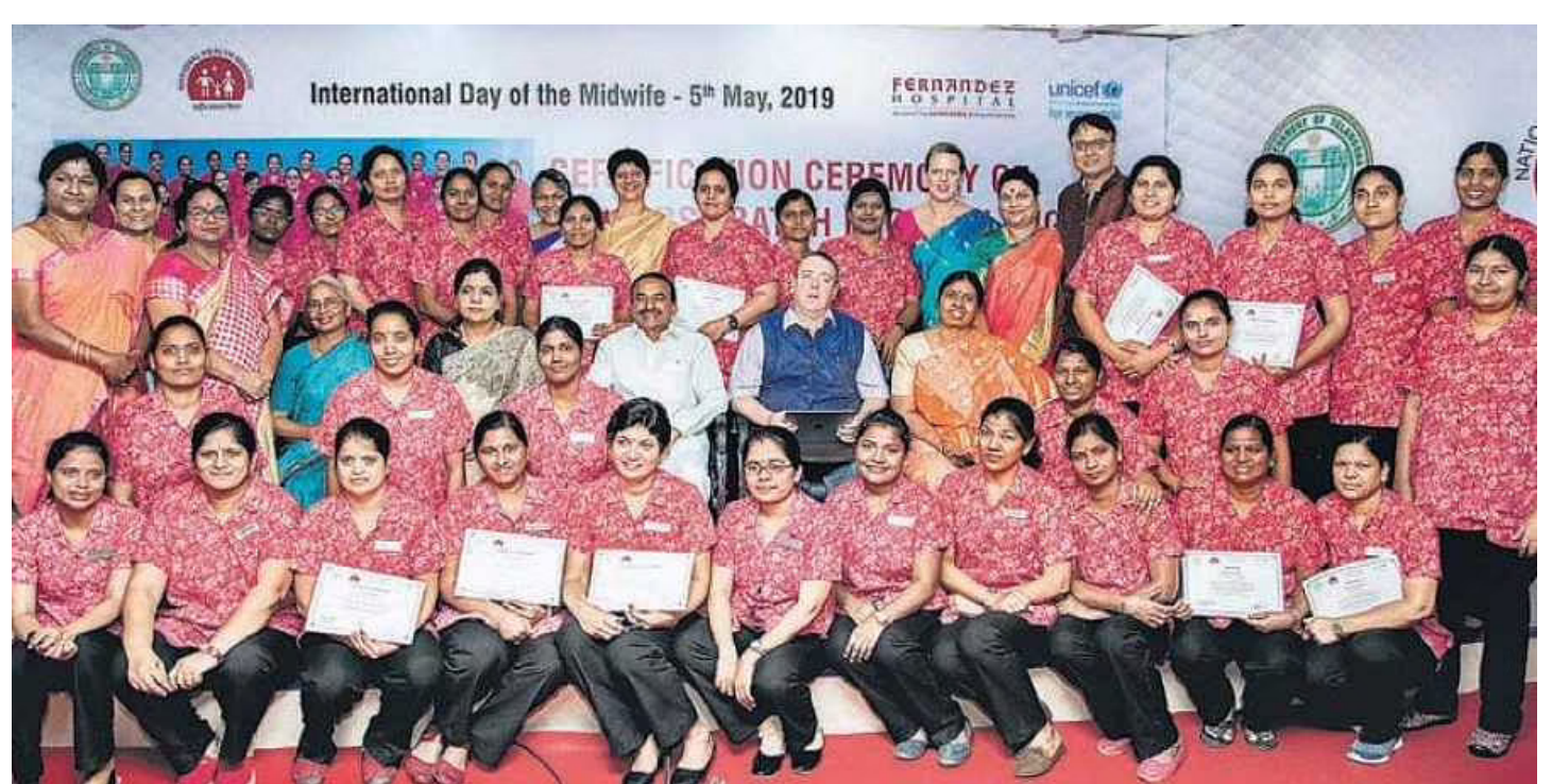
Minister Etela Rajender poses with a batch of midwives on International Midwife Day in Hyderabad on Sunday

Published: 06th May 2019 09:34 AM | Last Updated: 06th May 2019 09:34 AM