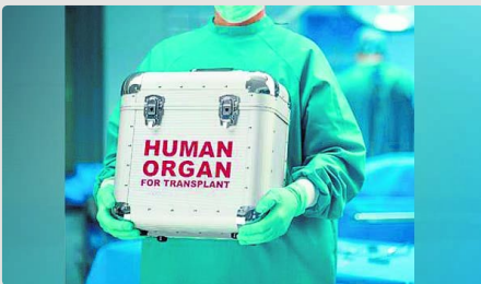
Brain-dead man gives new lease of life to 4 persons