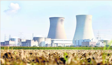
Kovvada nuclear power plant on track