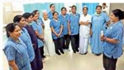
Fernandez Hospital Foundation staff creating awareness among the medical staff of the local hospital

There are 92 private hospitals in the district. The statistics state that the C-section rate is very high in private hospitals. Pregnant women are being threatened and the private hospitals are doing unnecessary C-sections for the greed of money. It is important to note that the normal deliveries account for only 29% while the C-section deliveries account for the 71% of the total deliveries in these hospitals. It is disastrous to know that even though the government has been giving importance to normal delivery, these private hospitals are neglecting the same. If this continues to be the same, the chances of pregnant women being prone to various health problems in future will be more.