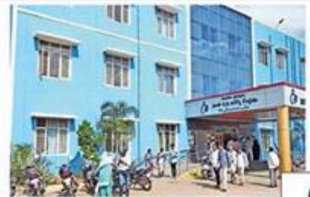
Mother and Child Health Centre, Sangareddy